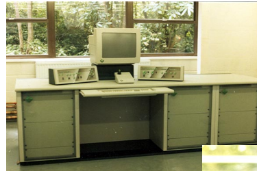
Microlab Mk3 Operators control panel and rack mounting system (Prototype)

Sadler Associates created a consistent product identity across companies along with a modular packaging for the individual products that met and exceeded the requirements.