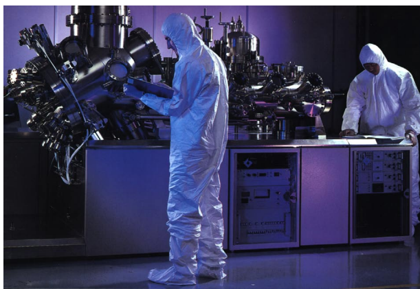
V90H Molecular Beam Epitaxy Equipment

design studio product design architecture